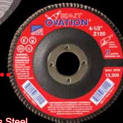
Ovation® High Density Flap Disc Will not contaminate Stainless Steel