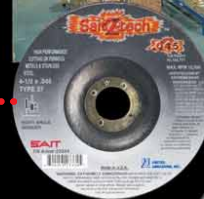
Z-tech .045 Cuts Carbon & Stainless Steel