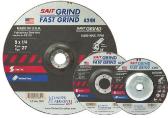
A24N Fast grinding