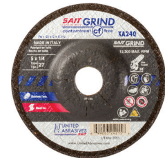
CONTAMINANT FREE STAINLESS Free of iron, sulfur, and chlorine (<0.1%) for nuclear & food processing plants