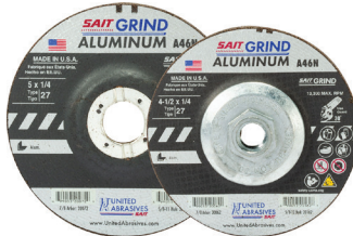
ALUMINUM Soft bond for aggressive stock removal without loading