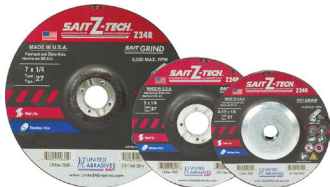
Z-TECH™ Premium zirconium grain for high performance