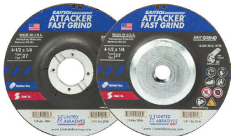
SAITECH ATTACKER® Premium ceramic grain for extremely fast grinding for stainless steel