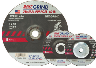
A24R General purpose