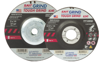
A24T Hard bond for edge grinding & long life