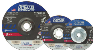
SAITECH ULTIMATE PERFORMANCE™ Premium ceramic grain for long life on stainless steel